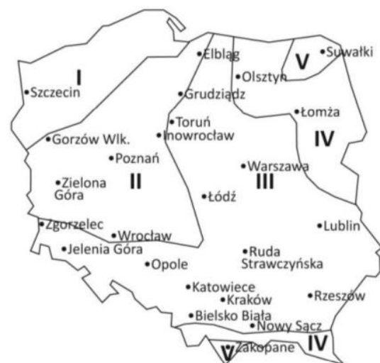
Fig. Climatic map of Poland